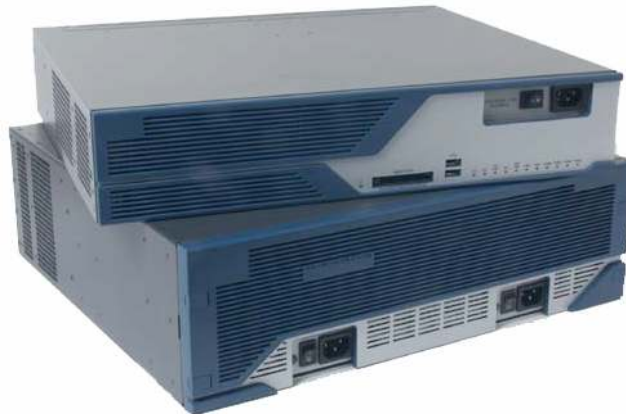
Figure 1. Cisco 3825 and Cisco 3845 Integrated Services Routers

Cisco Systems ® , Inc. is redefining best-in-class enterprise routing with a new portfolio of Integrated Services Routers optimized for secure, wire-speed delivery of concurrent data, voice, and video services. Founded on 20 years of innovation, the Cisco ® 3800 Series of Integrated Services Routers extends Cisco Systems' leadership in multiservice routing, providing customers with unparalleled network agility, performance, and intelligence. By transparently integrating advanced technologies, adaptive services, and secure enterprise communications into a single, resilient system; the Cisco 3800 Series routers ease deployment and management, lower network cost and complexity, and provide unmatched investment protection. The Cisco 3800 Series routers feature embedded security processing, significant performance and memory enhancements, and new high-density interfaces that deliver the performance, availability, and reliability required for scaling mission-critical security, IP telephony, business video, network analysis, and Web applications in the most demanding enterprise environments. Built for performance, the Cisco 3800 Series routers deliver multiple concurrent services at wire-speed T3/E3 rates.